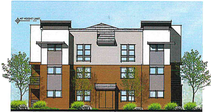
3 - UNIT 1,200 SF LEFT ELEVATION 3 - UNIT 1,200 SF