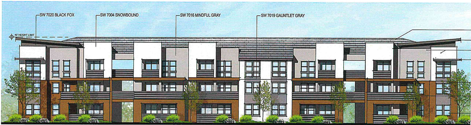
3 - UNIT 1,200 SF 1B - UNIT 650 SF 2A - UNIT 850 SF 2B - UNIT 950 SF FRONT ELEVATION REAR ELEVATION SIMILAR 2C - UNIT 950 SF

MONTE VISTA APARTMENTS Turlock, CA June 2, 2021