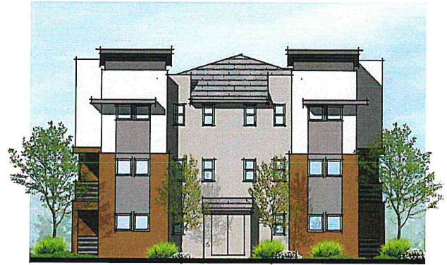
2C - UNIT 950 SF RIGHT ELEVATION 2C - UNIT 950 SF